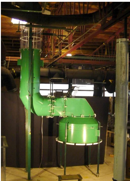
Figure 2 - Typical Single Absorber Wet Stack Flow Model

Physical flow models of wet duct and stack installations are normally built to a scale of between 1:12 and 1:16 and typically encompass the system from the outlet of the absorber mist eliminator to a point in the stack liner approximately 3 to 4 liner diameters above the roof of the breaching duct. Typical single and multiple absorber wet stack flow models are shown in Figures 2 and 3 respectively. To the extent possible, models are primarily fabricated from clear plexiglass to allow detailed visualization of the internal gas and liquid flows. To ensure that the liquid film motion in the primary collection zone of the lower liner are accurately simulated, care must be taken however to ensure that the surface of the material used in this area has wetting properties similar to that in the field.